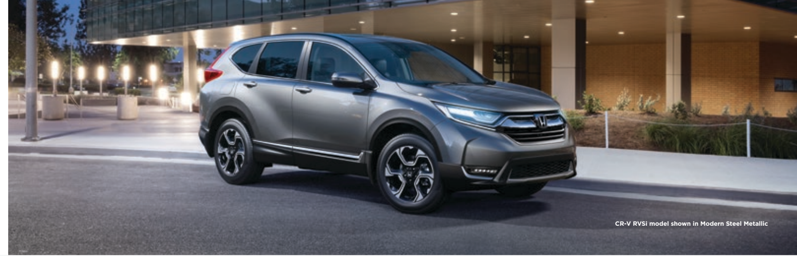
CR-V RVS1 model shown in Modern Steel Metallic

The vehicle that defined a category now redefines what a compact sport-utility vehicle can be. Introducing the completely reimagined Honda CR-V: delivering a wealth of standard features and driver and passenger conveniences. Welcome to the new standard in comfort, style and versatility.