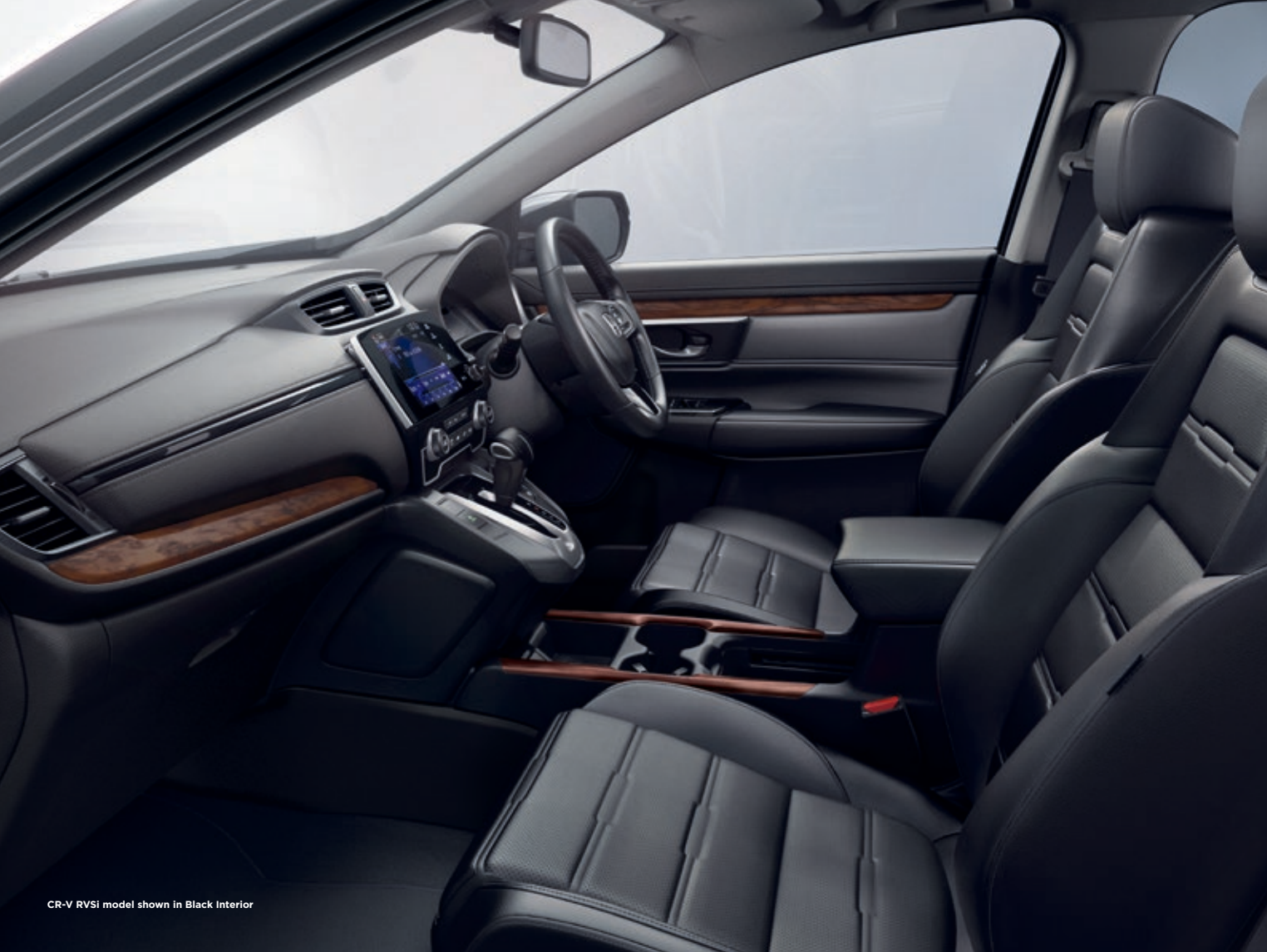
CR-V RVSi model shown in Black Interior