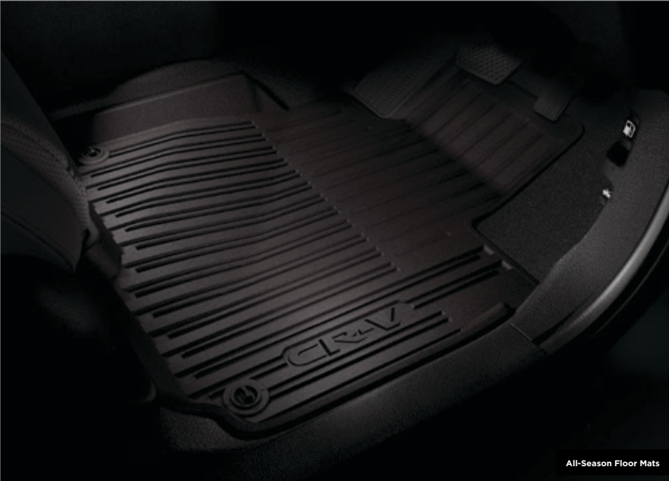
All-Season Floor Mats