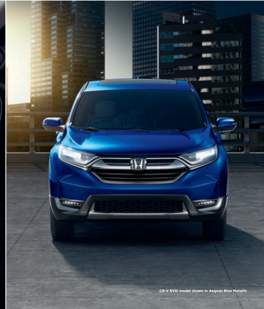
CR-V RVS1 model shown in Aegean Blue Metallic