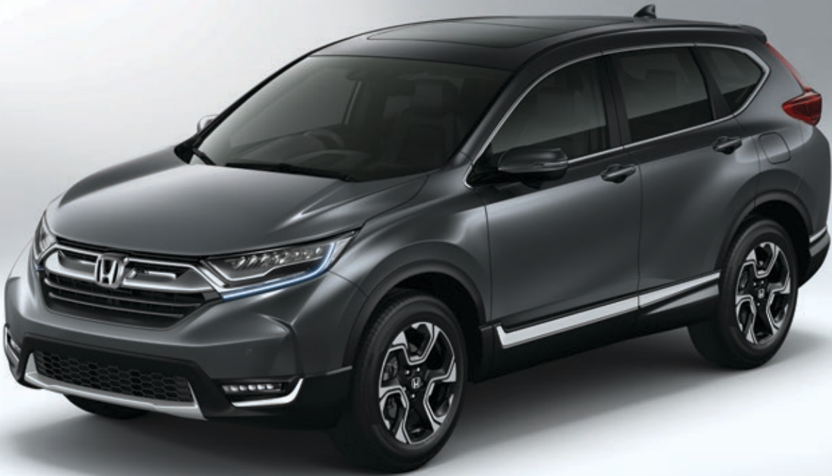
CR-V RVSi model shown in Modern Steel Metallic