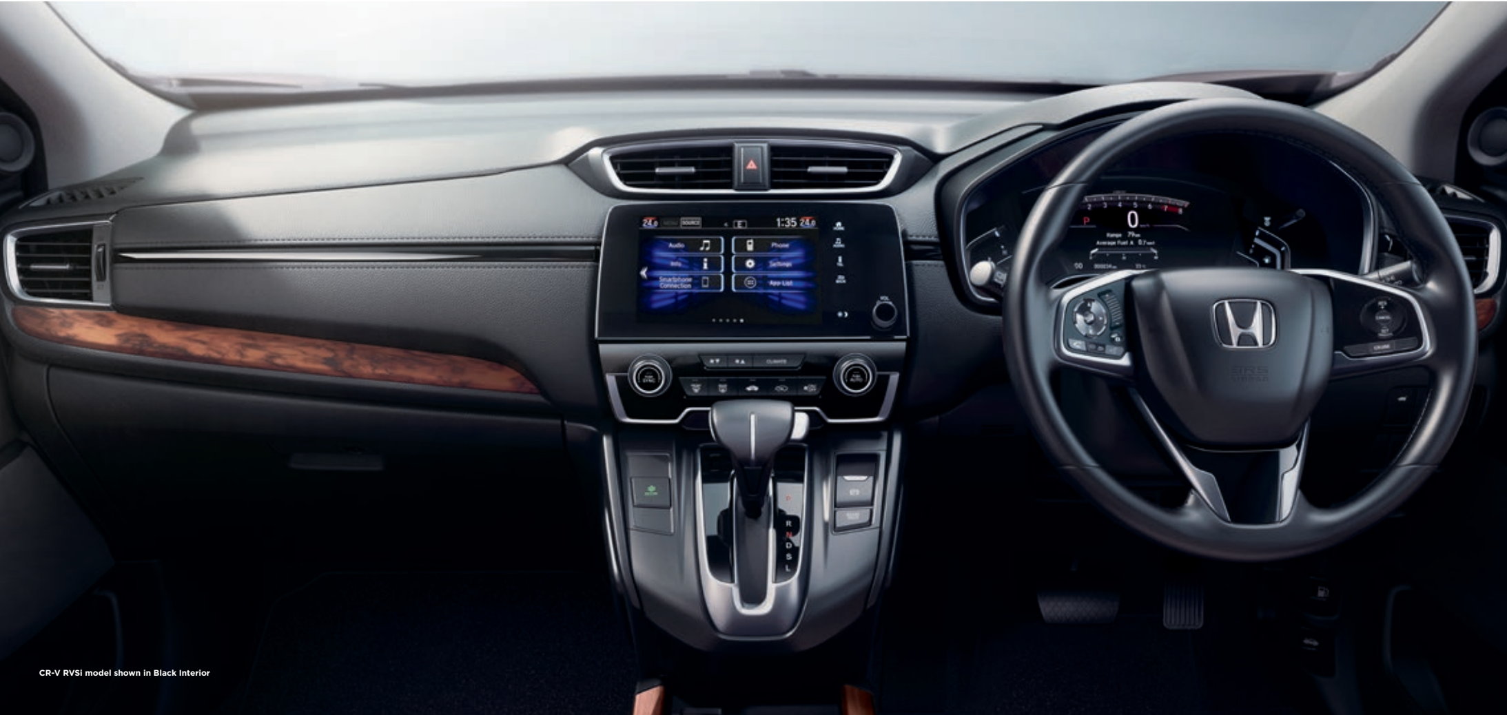
CR-V RVS1 model shown in Black Interior