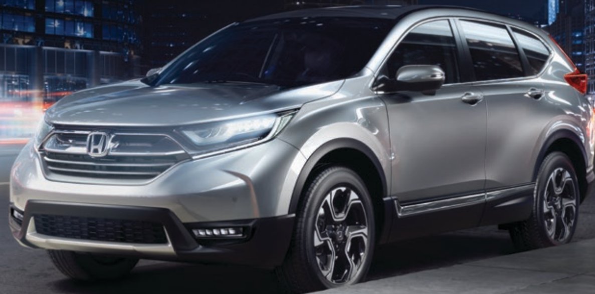
CR-V RVS1 model shown in Lunar Silver Metallic

Safety is always a priority for Honda. That is why every CR-V comes equipped with standard safety features designed to keep you and your loved ones comfortable and protected at all times.